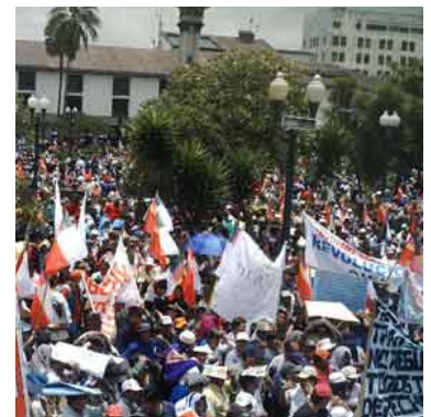
FEINE demonstration, March 2009

They were disappointed that medicines brought didn't fit the needs of clinics visited. Not professing Christians themselves they felt subject to being “missionized” in the multiple worship experiences. It was the service projects with the indigenous that had attracted them to be part of the venture. They were challenged by the generally low status accorded women in spite of